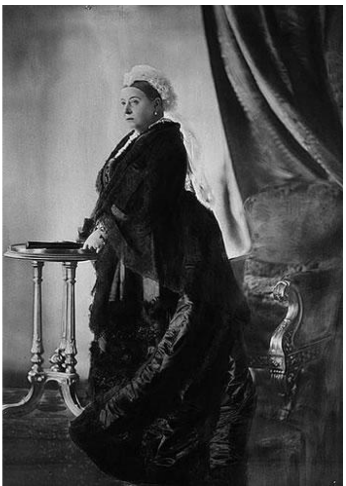
Full length portrait of Her Majesty Queen Victoria

Around the world, places and memorials have been dedicated to her, especially in the Commonwealth nations, including the capital of the Seychelles, Africa's largest lake, Victoria Falls, the capitals of British Columbia and Saskatchewan and two Australian States (Victoria and Oueensland). The Victoria Cross was introduced in 1856 to reward acts of valour during the Crimean War and it remains the highest British, Canadian, Australian, and New Zealand award for bravery. Victoria Day is a Canadian statutory holiday and a local public holiday in parts of Scotland celebrated on the last Monday before or on 24 May, Queen Victoria's birthday.